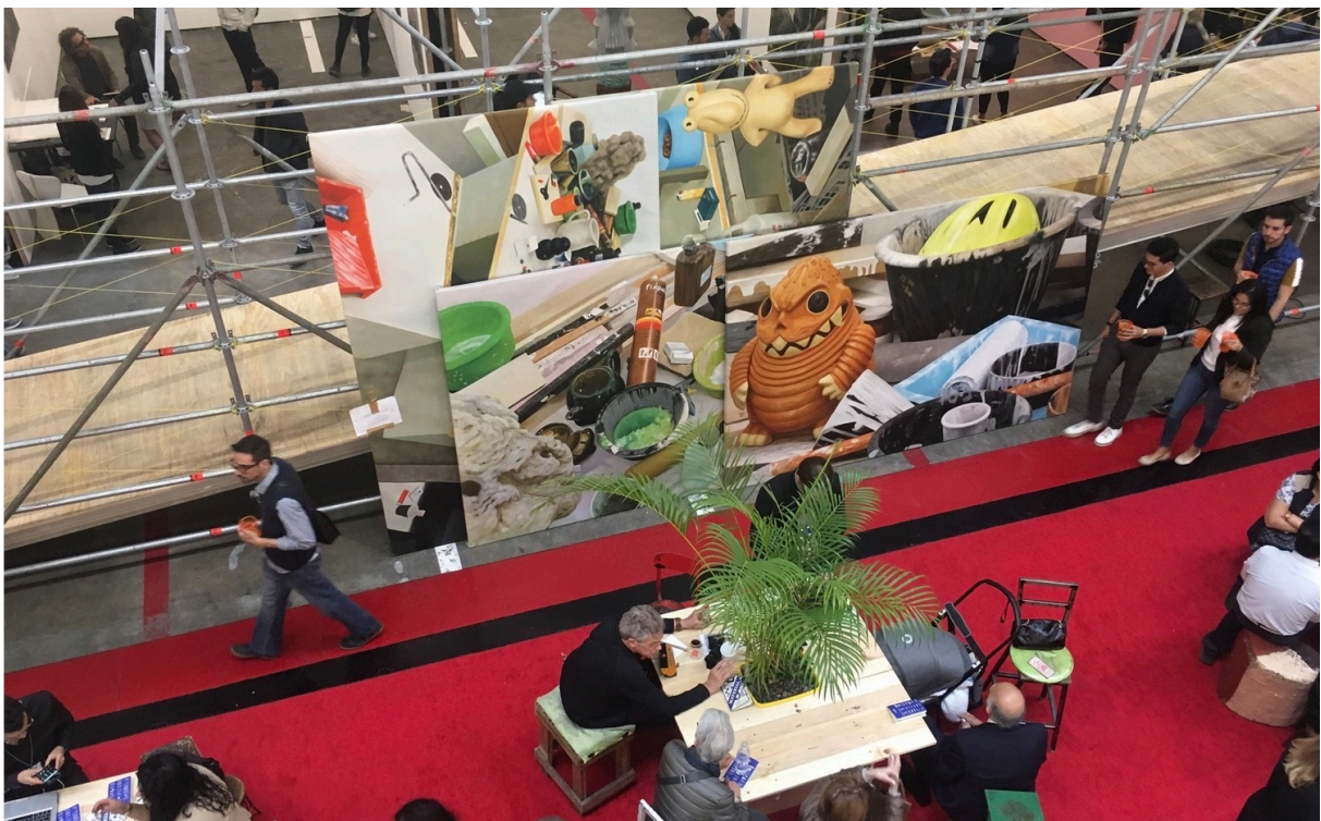
Material Art Fair Mexico City