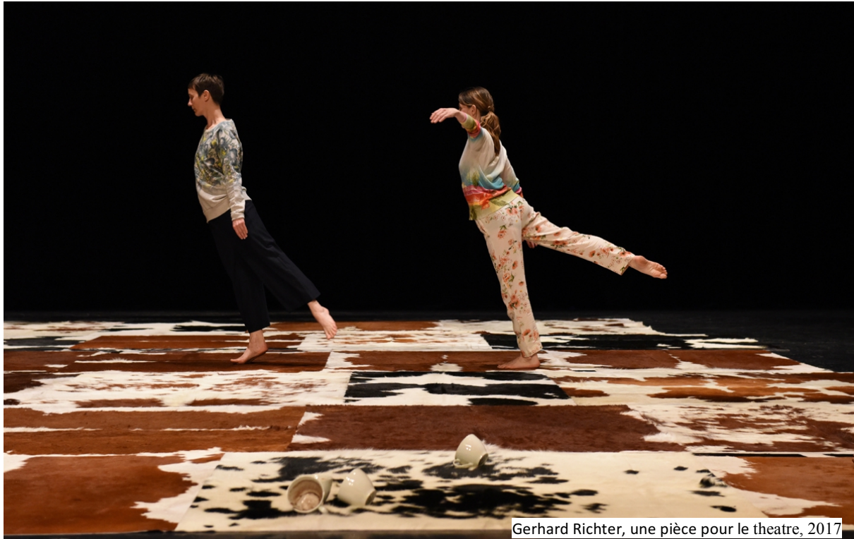
Gerhard Richter, une pièce pour le theatre, 2017