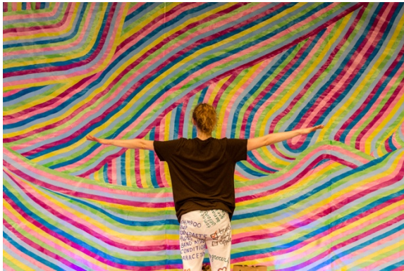
Premiere Gallery Supportico Lopez