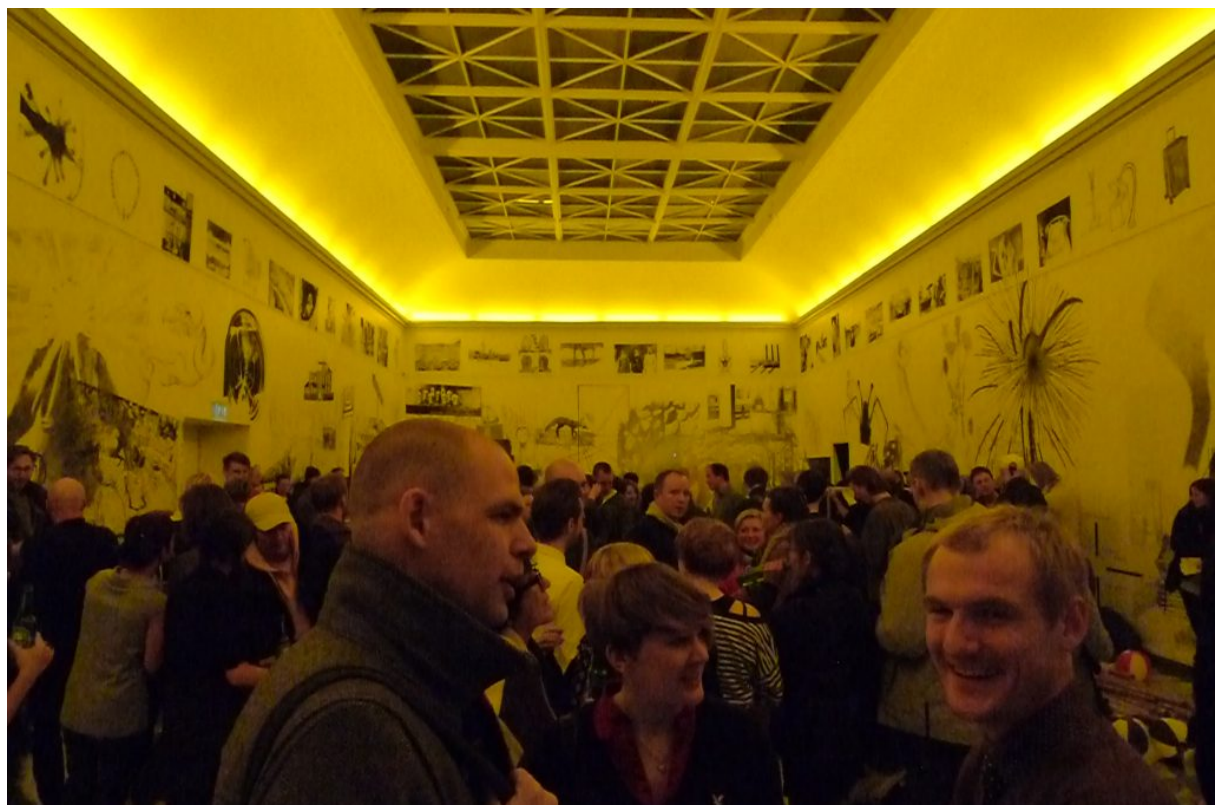
Göteborgs Konsthall, solo exhibition 2010