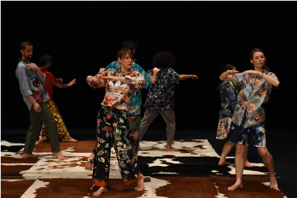
Premiere Kunstenfestivaldesarts 2017