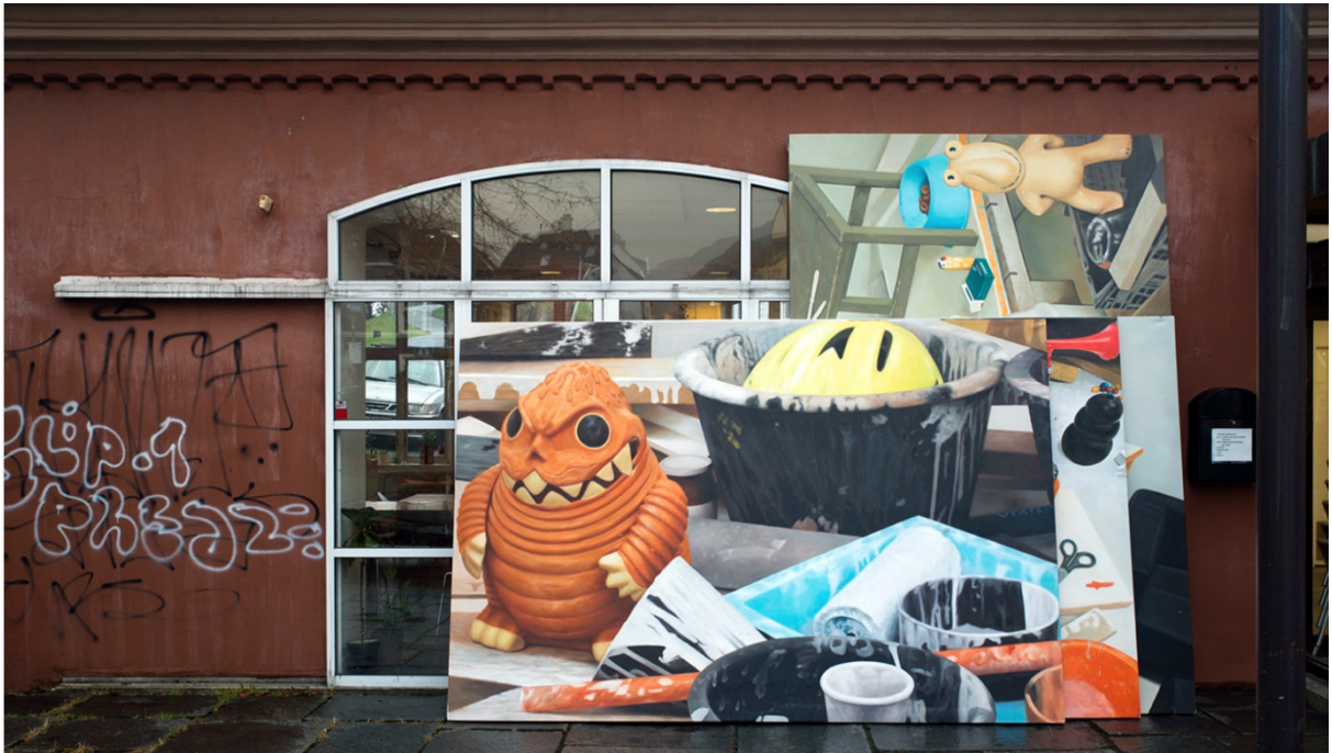
Hordaland Kunstsenter groupshow