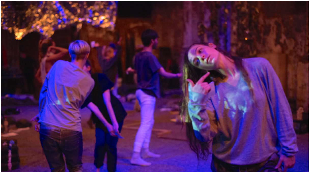
Premiere Kunstfestivals de arts 2016