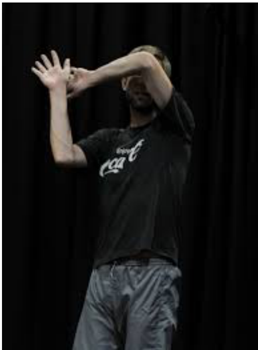
Premiere Tanz im August